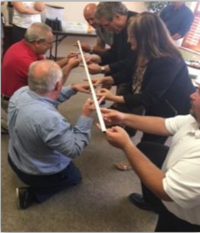
The Administration team met on August 10.