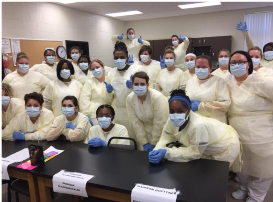
New LPN students get acquainted with their medical supplies and don their personal protective equipment!