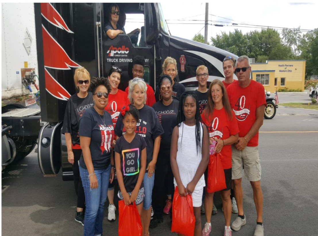
Apollo staff, family, and friends were on hand to pass out goodies to parade-goers at the Allen County Fair Parade.