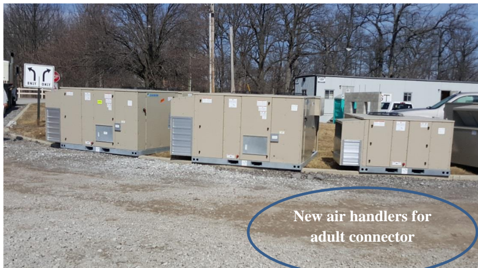
New air handlers for adult connector