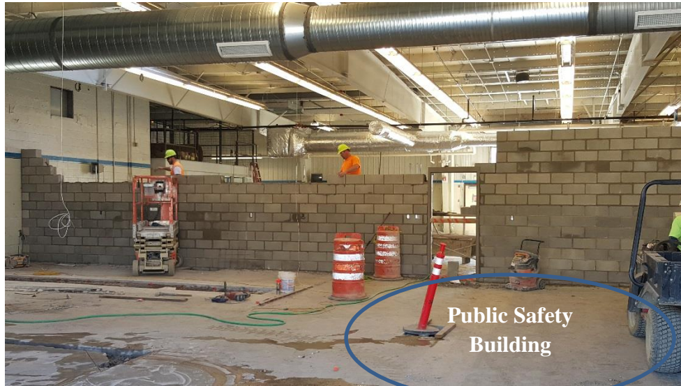
Public Safety Building