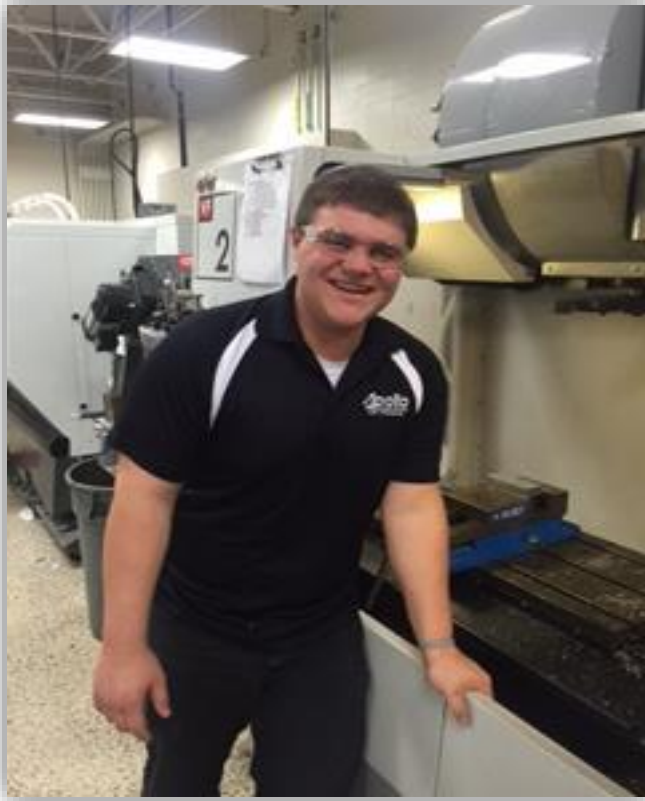
An Automated Manufacturing Technology student is working on the CNC.