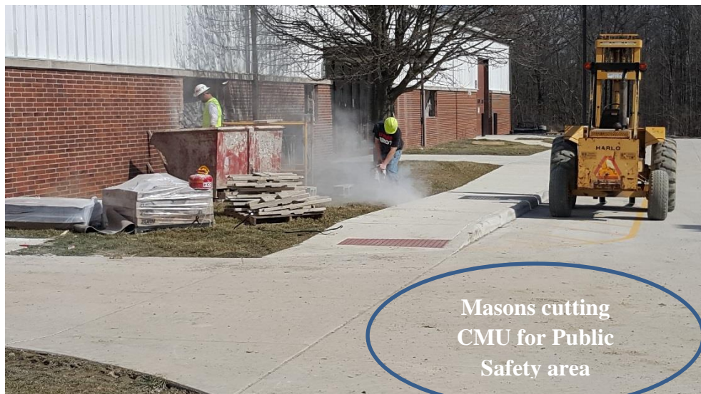
Masons cutting CMU for Public Safety area