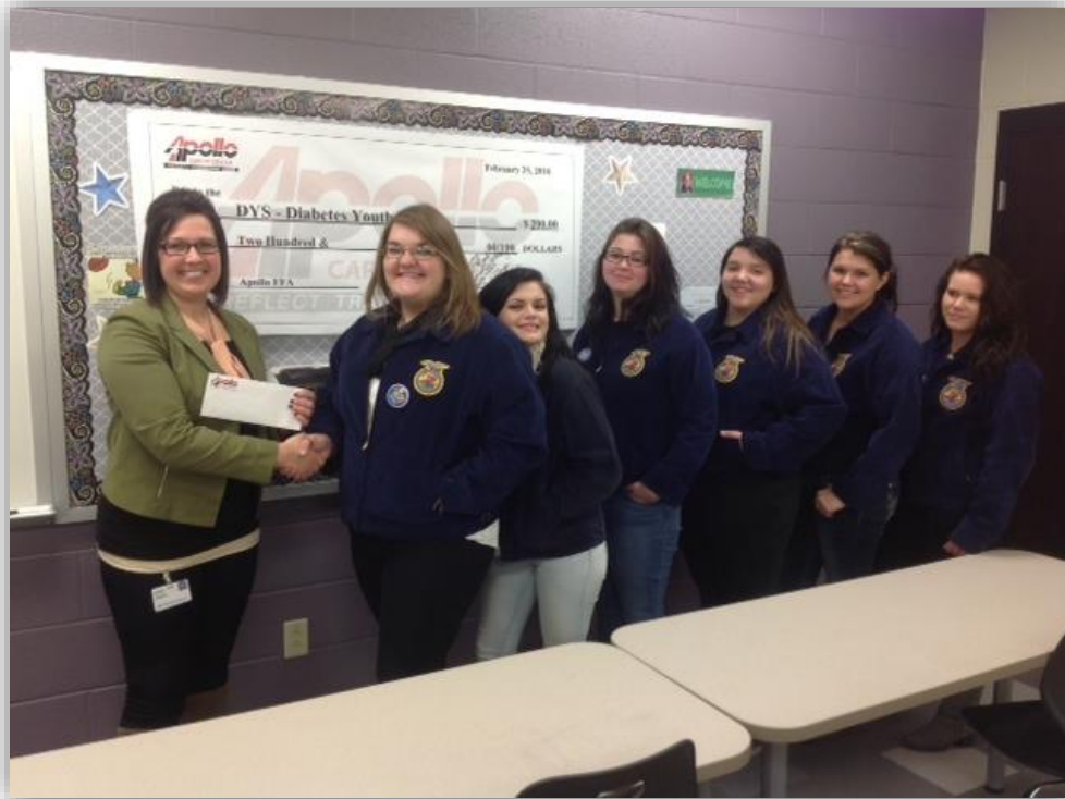
Floral Design/Interiors/FFA presenting the check to the Diabetes Youth Services. They raised $200.