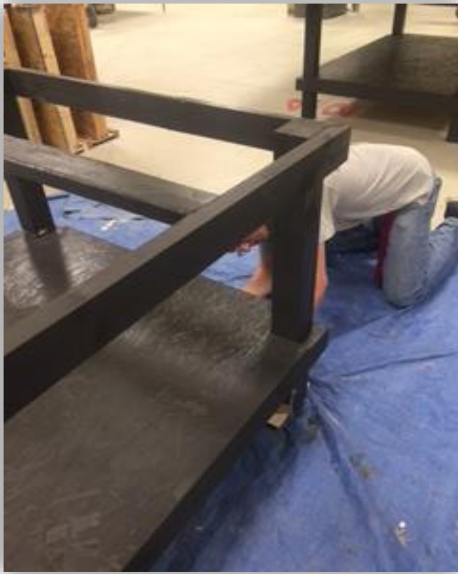
A Carpentry project.