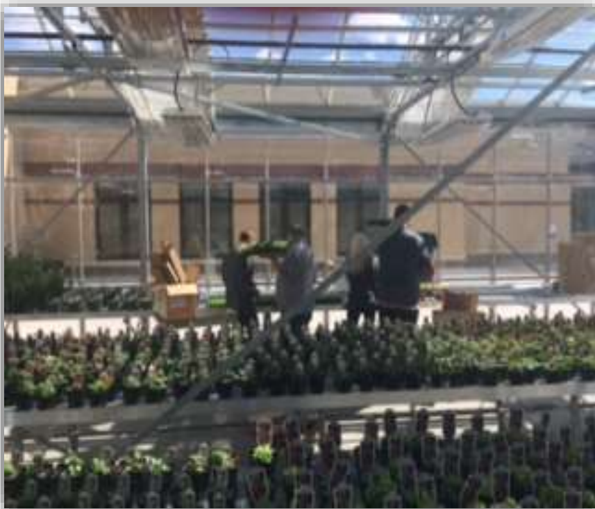
Floral Design/Interiors' students are in the process of propagation for the Spring Plant sale.