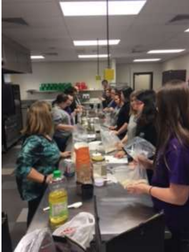
Early Childhood Education students are learning about nutrition.