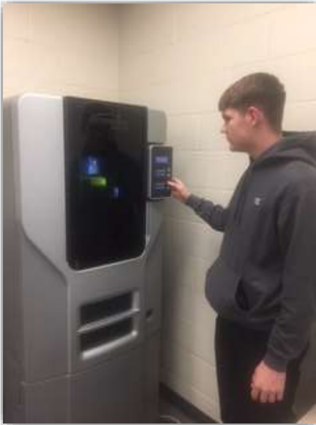
Automated Manufacturing Technology student making a car for Rhodes Engineering Day using the 3D Printer.