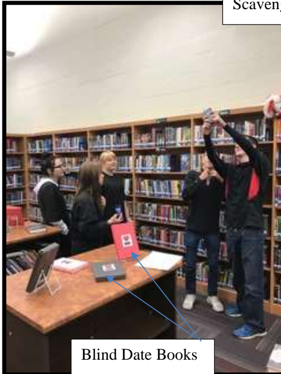
Blind Date Books