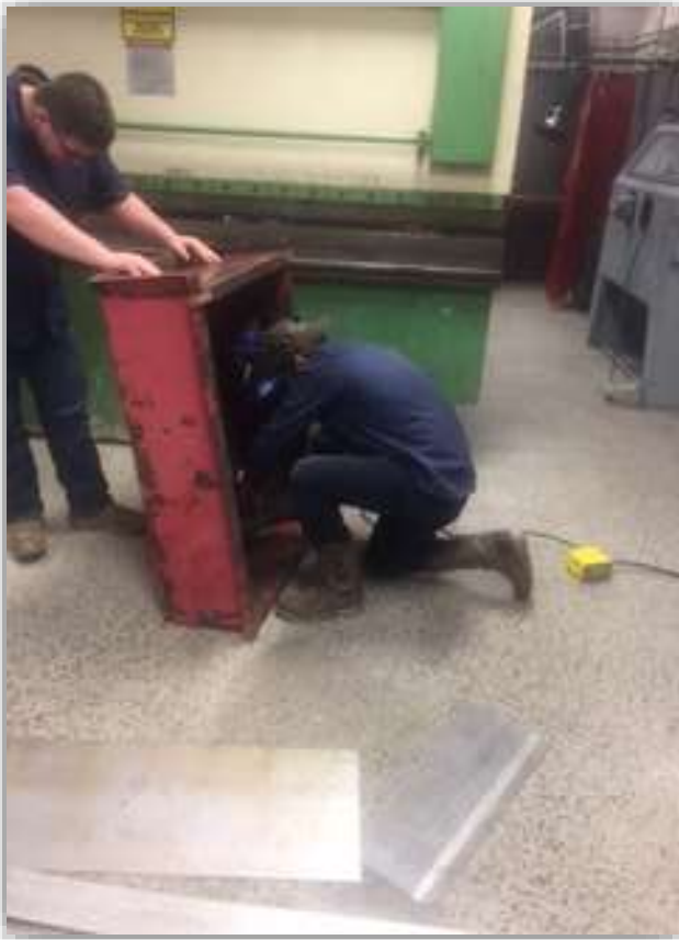
Welding and Fabrication students are repairing a trailer.