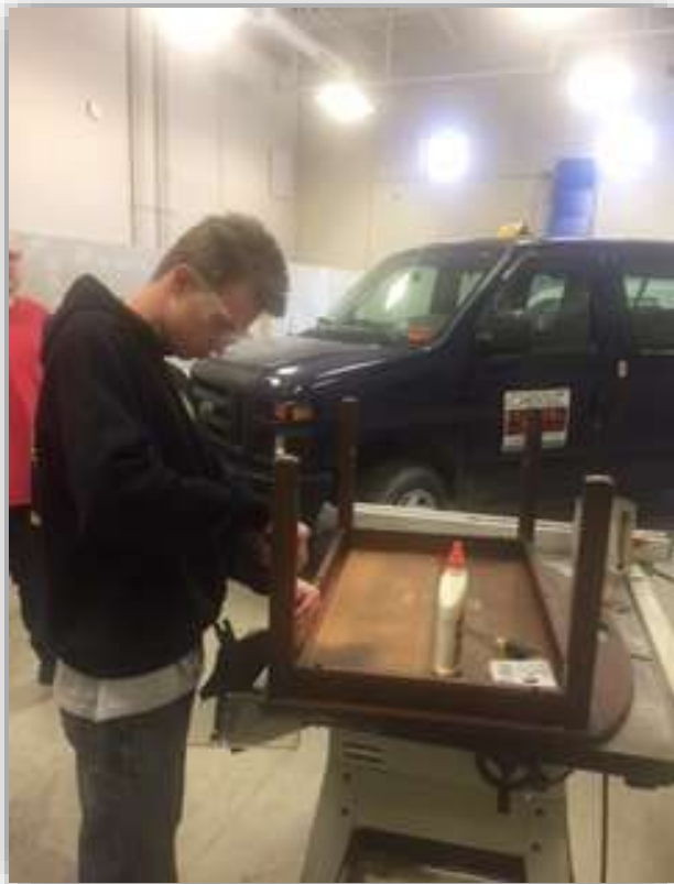
Building and Renovations' student is repairing a table.