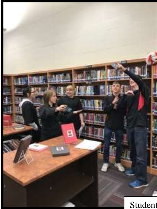
Students engaged in the Scavenger Hunt.