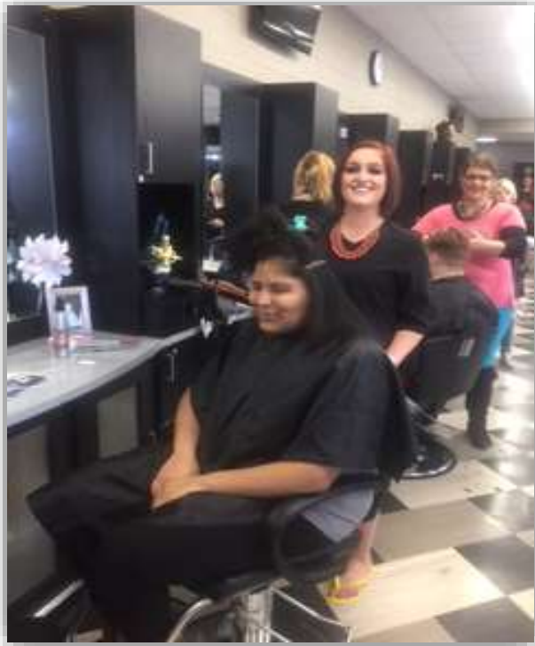
Spa Day Fund Raiser was held on Friday, March 10.