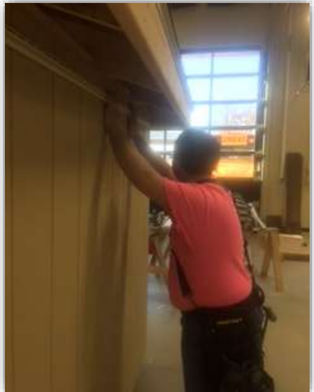
A Carpentry student is working on a shed.