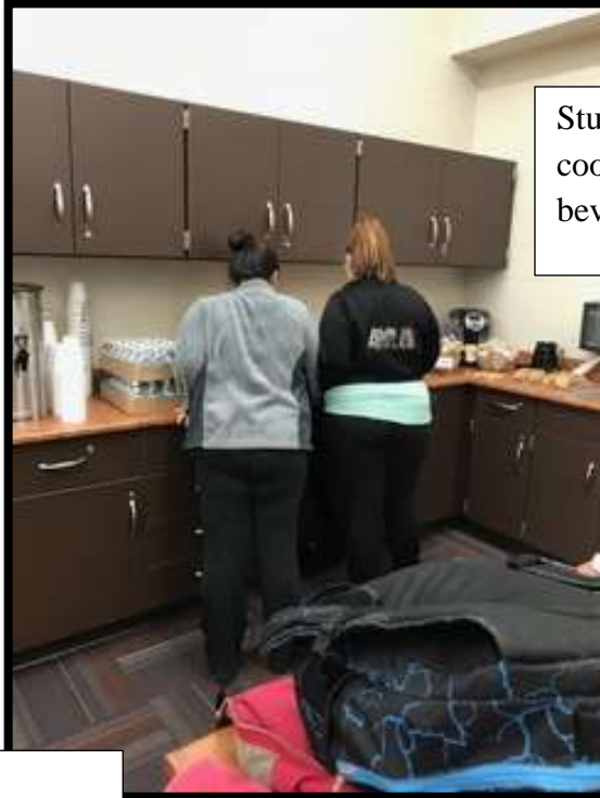
Students choosing cookies and a beverage to enjoy.