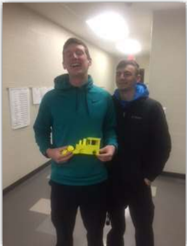
A car made from the 3D Printer for Rhodes Engineering Day.