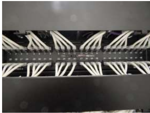
Labeling and Documentation