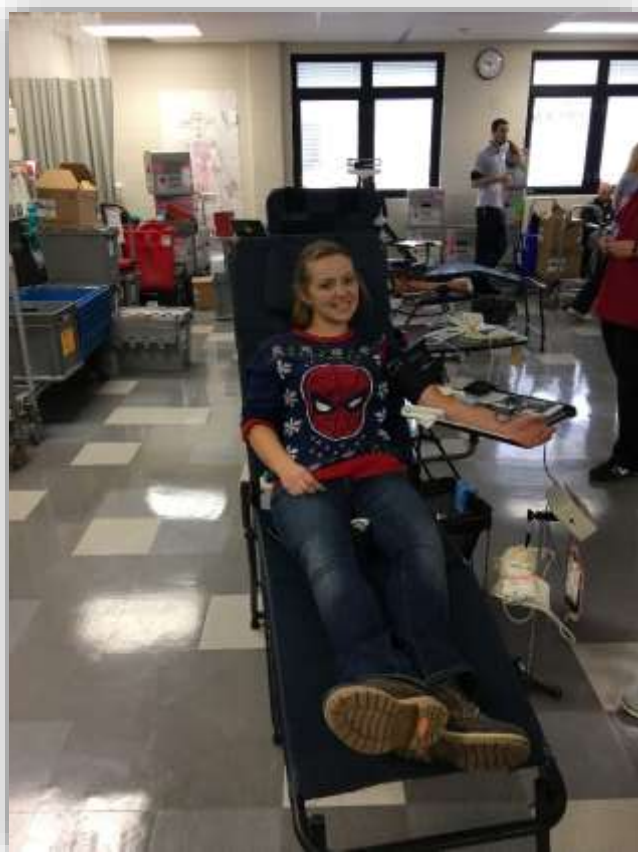
Health Science HOSA/Blood Donor Day through the American Red Cross was held on December 21.