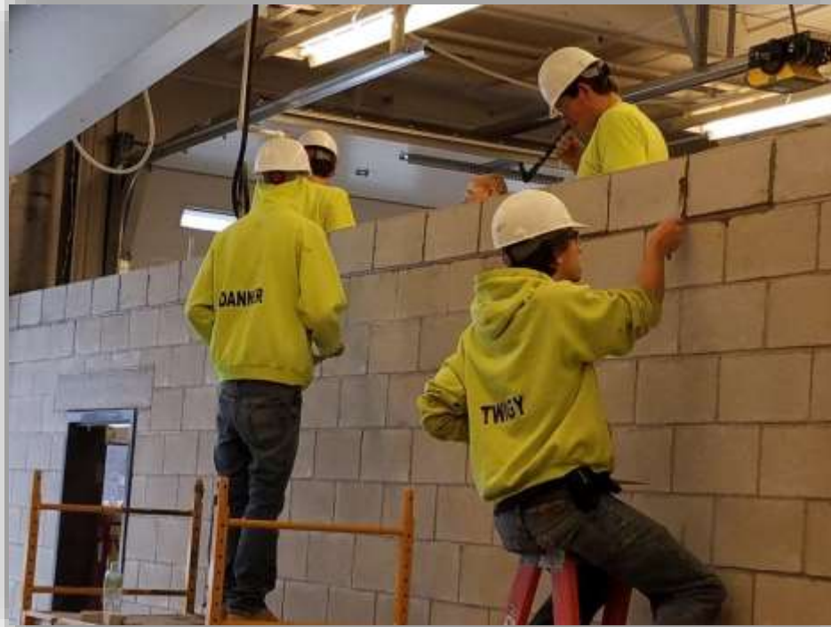
Construction and Equipment Technology students are laying block in the Adult Education building.