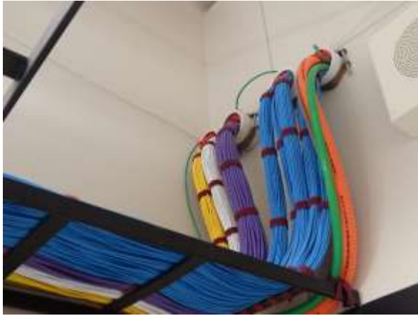
Cable Pathing and Entry