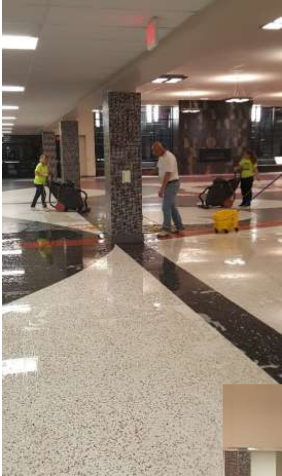
Our great custodial crew stripping and re-sealing the commons floors.