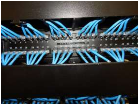
Rack and Patch Panel