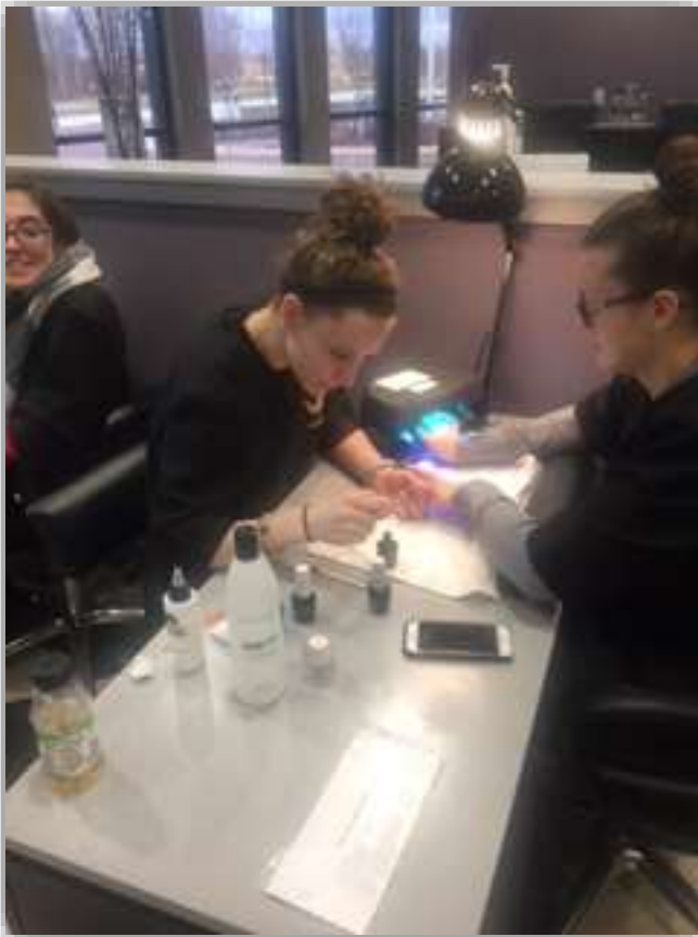
Spa & Esthetics Technology students are practicing nail prep.