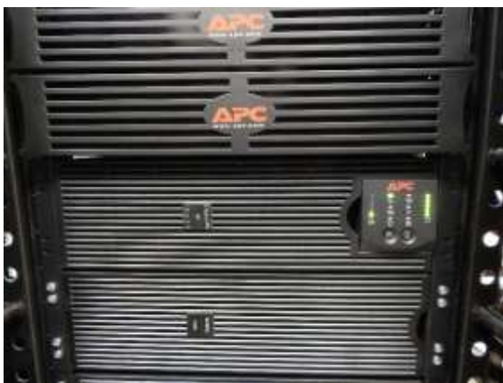
Surge Protection/Power Stability