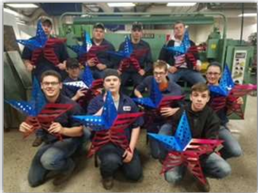
Welding students plasma cut and powder coated the stars.