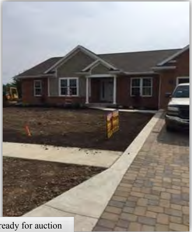
The Apollo house is ready for auction on Saturday, June 25 at 10:00.